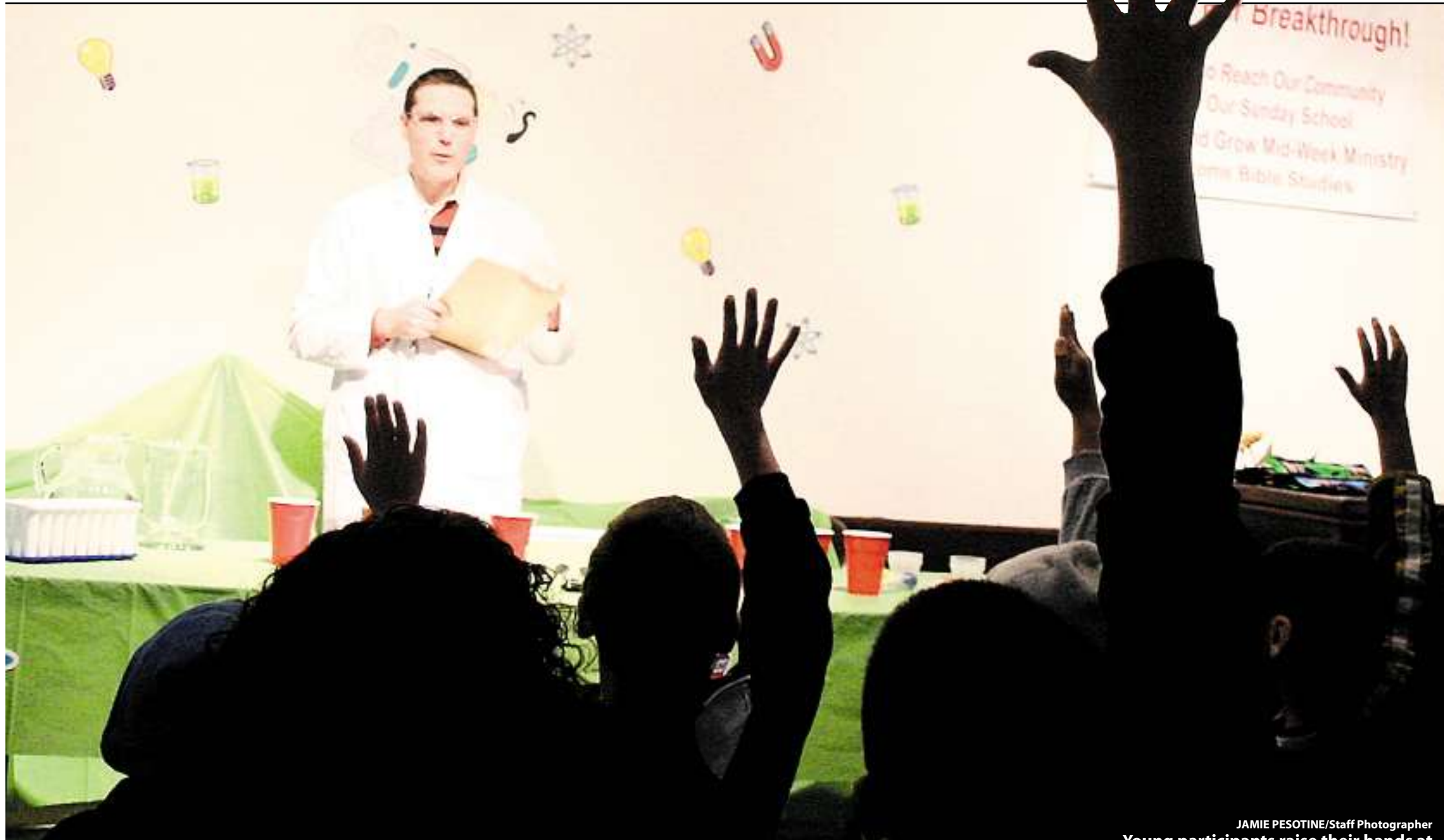
Young participants raise their hands at a chance to help out on a science experiment held at Church Alive on Saturday as part of their Slime Time event.