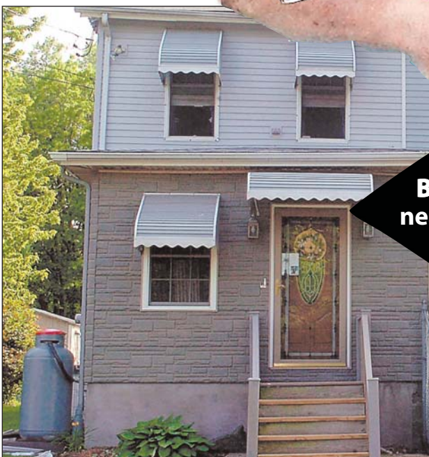
But, he lives here, near Hillside Drive.

Reassessed values began hitting mailboxes Thursday